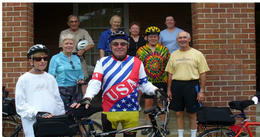
PSC Bike riders